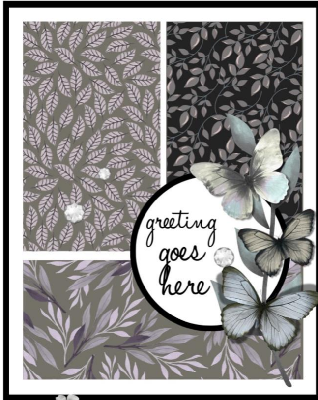
Sketch by Stamp with Jenn -2026- www.StampwithJenn.com