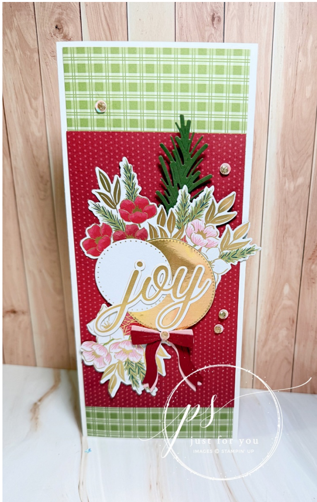
Stamp with Jenn © Newsletter ~ November 2025