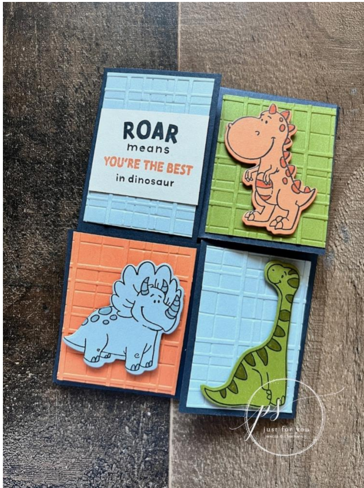
Stamp with Jenn © Newsletter ~ November 2025